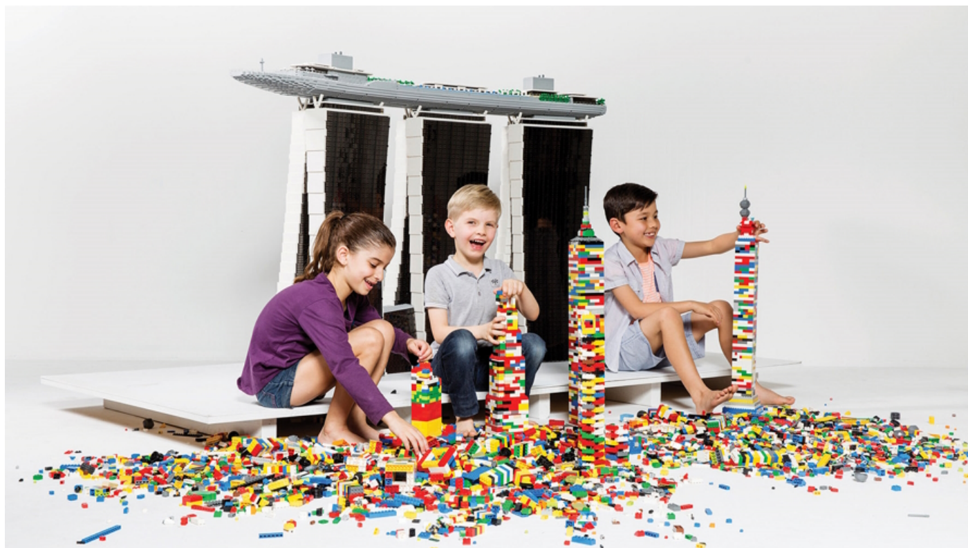
"Towers of Tomorrow with Lego Bricks"