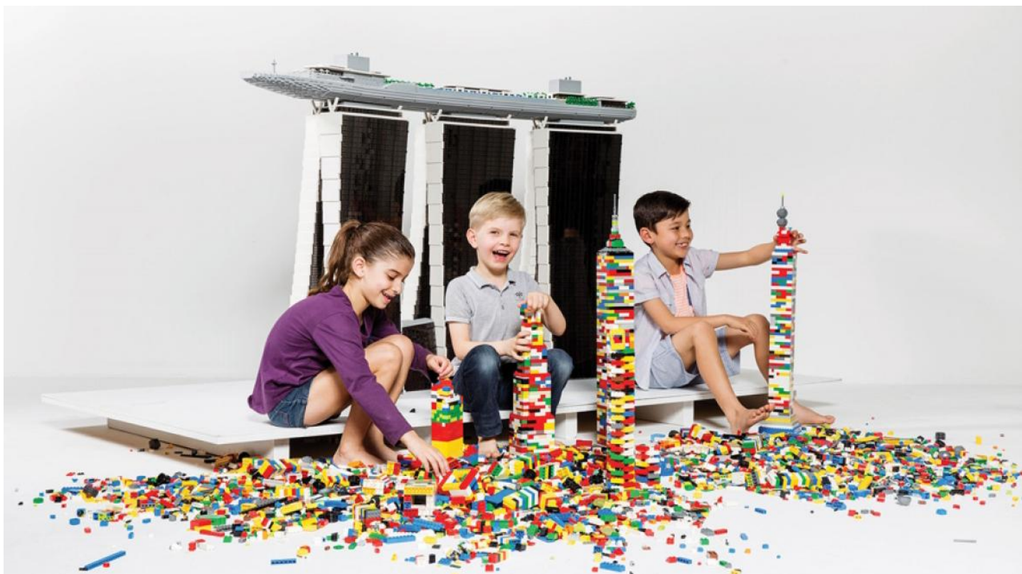
PHOTO: "Towers of Tomorrow with Lego Bricks"

Even for families that fill each fall with arts outings and every winter with holiday shows ( https://www.parentmap.com/article/let-holidays-show-your-family-good-time ), spring tends to draw their attention outside. But this is Seattle; in the springtime, there are still lots of rainy days to fill ( https://www.parentmap.com/article/rainy-day-recess-places-to-play-inside-seattle-area ) and even more