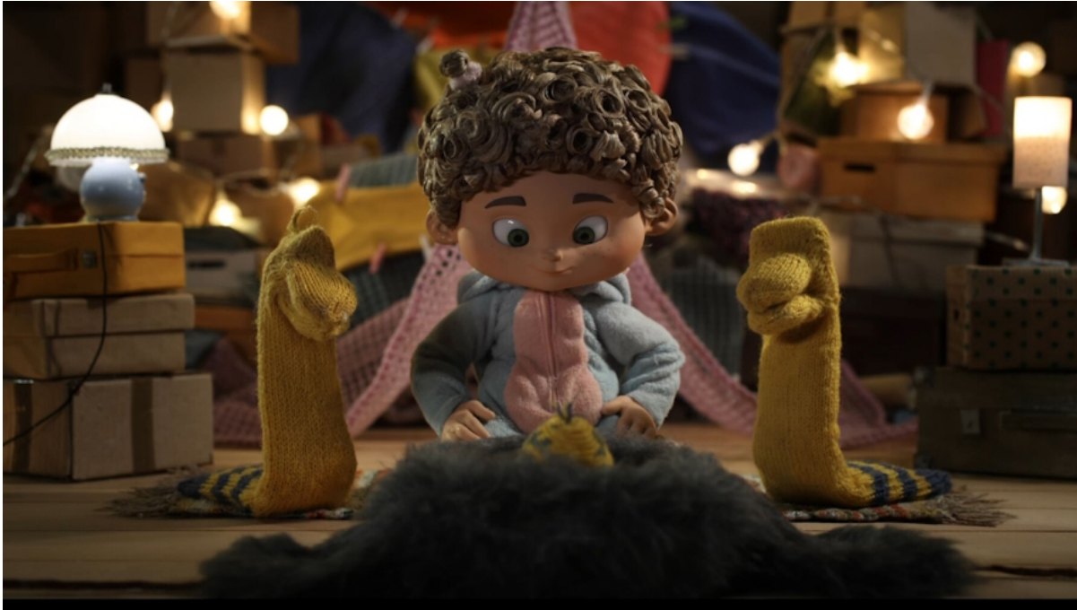
"The Mystery of Missing Socks," a short from the Lost and Found program.

Legends ( https://nwfilmforum.org/films/cffs-2024-myths-and-legends-ages-14-hybrid/ .) (14+) combines traditional stories and brand-new mythologies from around the world.