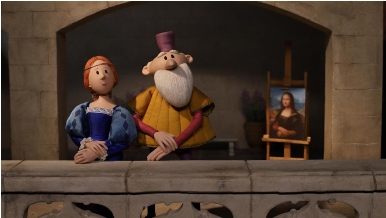
PHOTO: "The Inventor," photo courtesy of Children's Film Festival Seattle

Outer space is infinite and so is a child's imagination. This year, Children's Film Festival Seattle (CFFS) celebrates both with five feature films and 21 shorts programs (that's nearly 200 films from 40 countries!) offering families the opportunity to discover and explore new worlds. The 19th annual Children's Film Festival Seattle ( https://nwfilmforum.org/festivals/childrens-film-festival-seattle-2024-hybrid/ ) runs Feb. 2–10 in person and online.