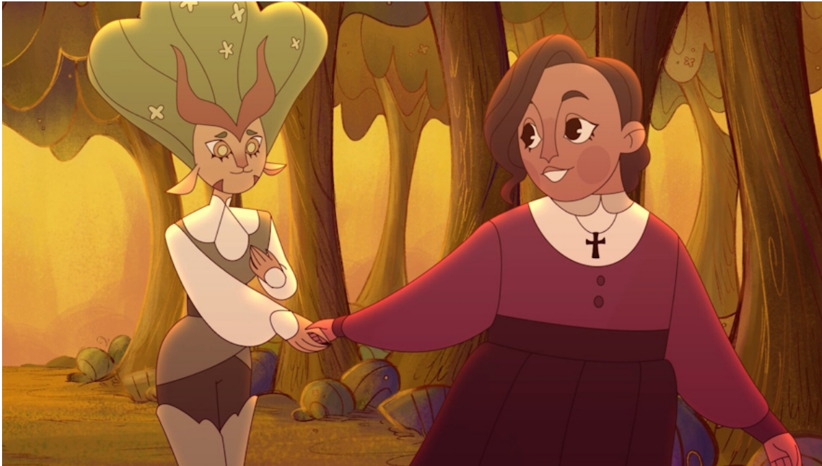
"Amongst The Myrtle Trees," a short from the Queer Quest program.

2024-surrounded-by-symphonies-all-ages-hybrid/ ). (there may also be subtitles). This year's identity-focused programs include Black is Beautiful ( https://nwfilmforum.org/films/cffs-2024-black-is-beautiful-ages-12-hybrid/ ), a collection centering young Black protagonists; Indigenous Inspirations ( https://nwfilmforum.org/films/cffs-2024-indigenous-inspirations-ages-13-hybrid/ ), showcasing Indigenous stories from around the world; and Queer Quests ( https://nwfilmforum.org/films/cffs-2024-queer-quests-ages-10-hybrid/ ), presenting a mix of sweet fairy tales and stories of children who challenge the status quo by showing their true colors.