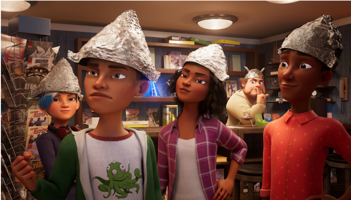
"Headspace,"