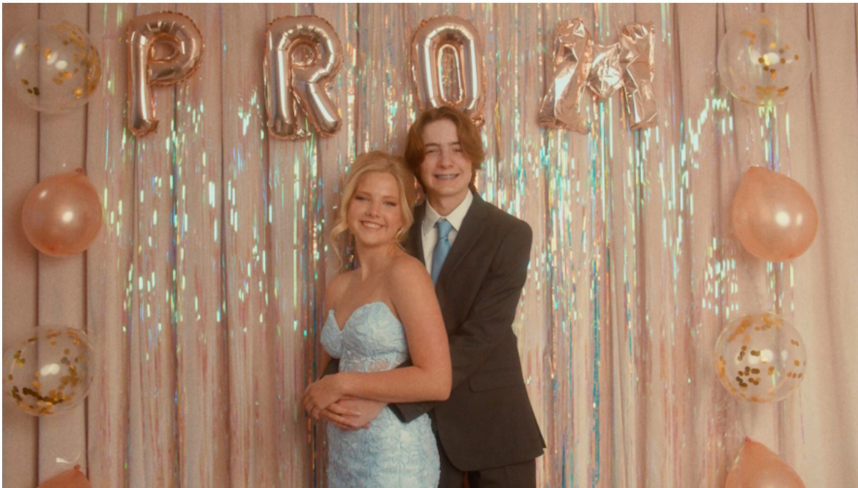
“Homeschooled,” photo courtesy of Children’s Film Festival Seattle

The Generations of Imagination ( https://bit.ly/cffs2024generations ) screening on Feb. 4 celebrates intergenerational relationships. Salvador Salazar, director of the short film “ Marias ,” will be in attendance and all grandparents and other caregivers will be admitted at half price ($7).