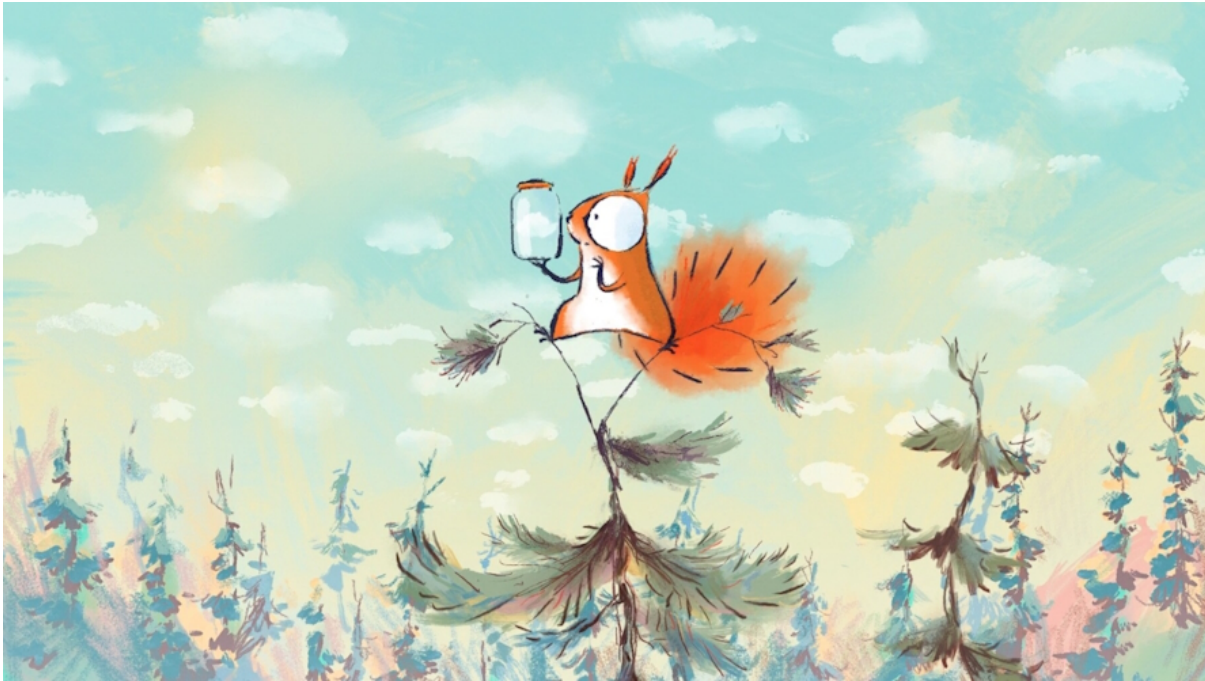
"Head in the Clouds," a short from the Imagination Creations program.

For tweens and teens, " Lost and Found ( https://nwfilmforum.org/films/cffs-2024-lost-found-ages-10-hybrid/ )" (10+) follows stuff that's gone missing and important finds, and " Where I Belong ( https://nwfilmforum.org/films/cffs-2024-where-i-belong-ages-10-hybrid/ )" (10+) tells stories about young people finding their own unique place in the world. " Family Hug ( https://nwfilmforum.org/films/cffs-2024-family-hug-ages-13-hybrid/ )" (13+) includes some tear-jerkers about families dealing with the hard stuff together, while " New Homes ( https://nwfilmforum.org/films/cffs-2024-new-homes-ages-13-hybrid/ )" (13+) focuses on the immigrant experience. " Myths and