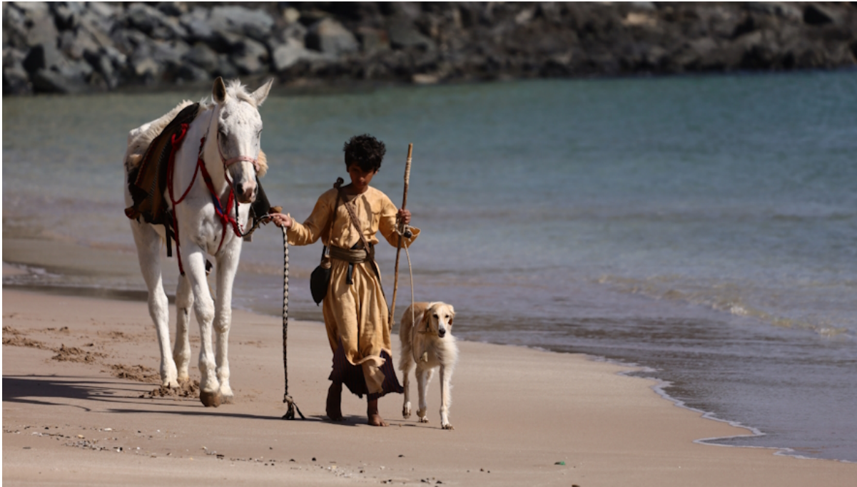
"Mountain Boy," photo courtesy of Children's Film Festival Seattle