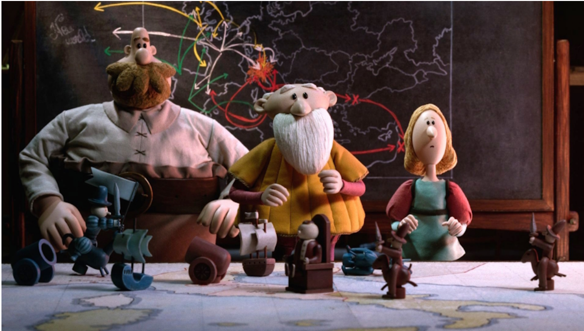
"The Inventor," photo courtesy of Children's Film Festival Seattle