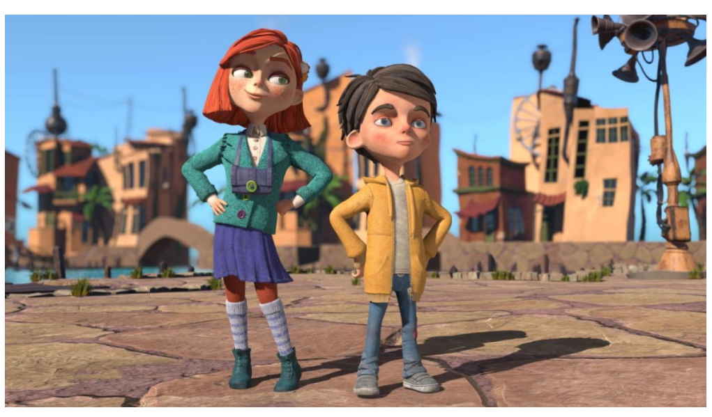
PHOTO: The animated film "Journey to Yourland" is one of the feature films in this year's Children's Film Festival Seattle.