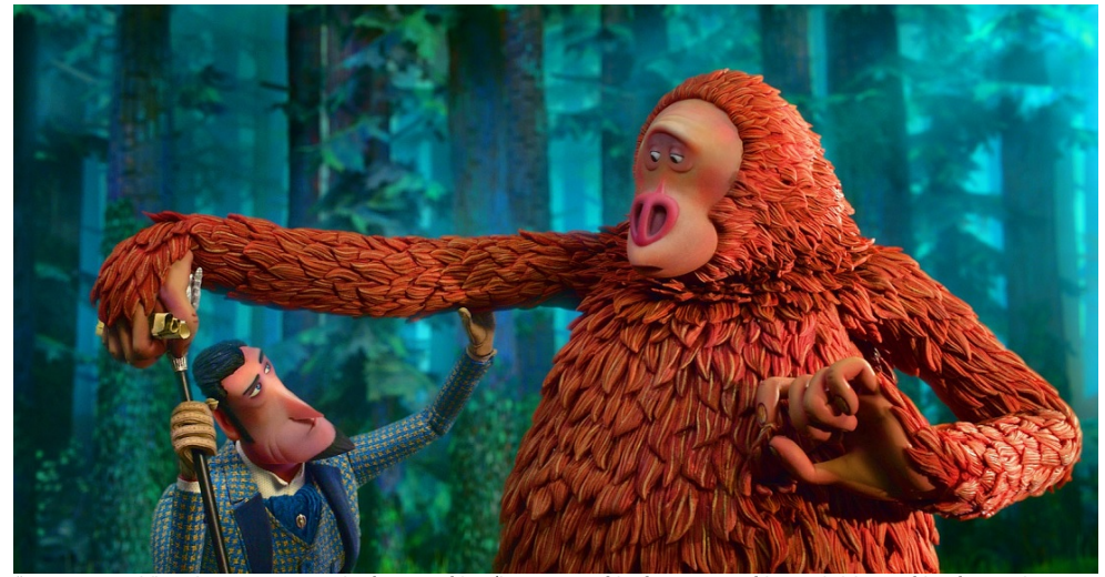
"Missing Link" is the <u>opening night feature film (https://nwfilmforum.org/films/childrens-film-festival-</u> seattle-2023-missing-link-laika-in-person-only/) of the 2023 Children's Film Festival Seattle.