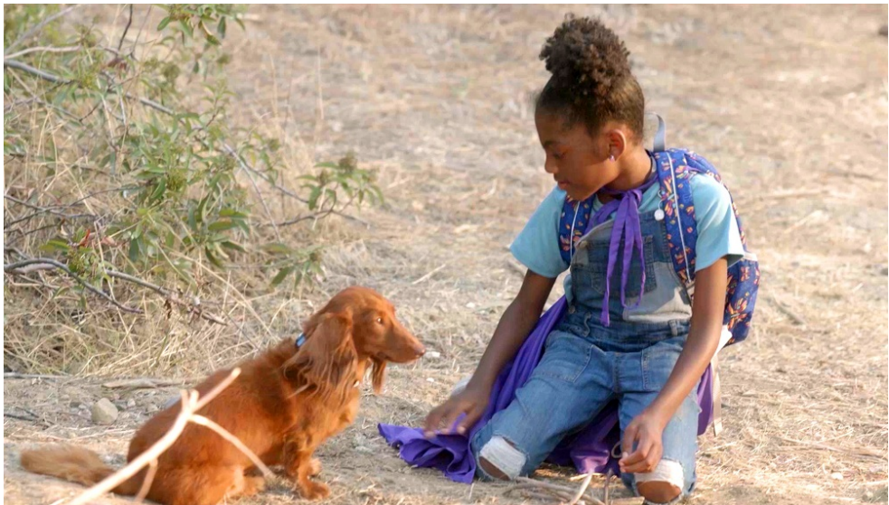
The short film "Charlie and the Hunt" is part of the <u>Dream Black shorts program</u> (<u>https://nwfilmforum.org/films/childrens-film-festival-seattle-2023-dream-black-hybrid/)</u> in the 2023 Children's Film Festival Seattle.

(https://nwfilmforum.org/films/childrens-film-festival-seattle-2023-little-help-fromfriends-hybrid/) leans even more intentionally into relationships. While the stories in Hopeful Harmonies (https://nwfilmforum.org/films/childrens-film-festival-seattle-2023hopeful-harmonies-hybrid/) might be too intense for some younger kids, their musical themes are universal.