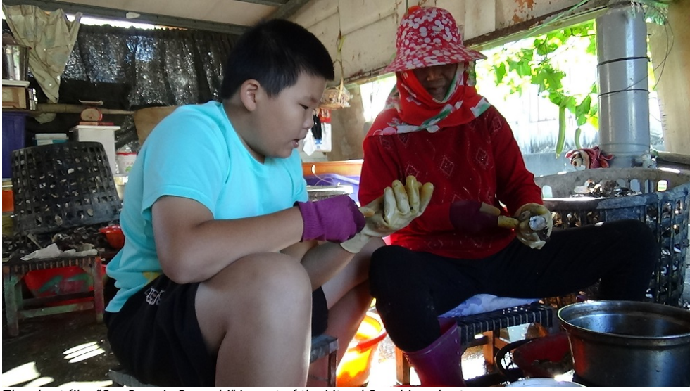
The short film "Our Days in Dongshi" is part of the <u>Literal Sunshine shorts program</u> (<u>https://nwfilmforum.org/films/childrens-film-festival-seattle-2023-literal-sunshine-hybrid/)</u> in the 2023 Children's Film Festival Seattle.

<u>accessible-youths</u>), admission for teenagers is only $5. The evening begins with a silkscreening demo in the lobby, followed by the short film program "Figuring It Out."