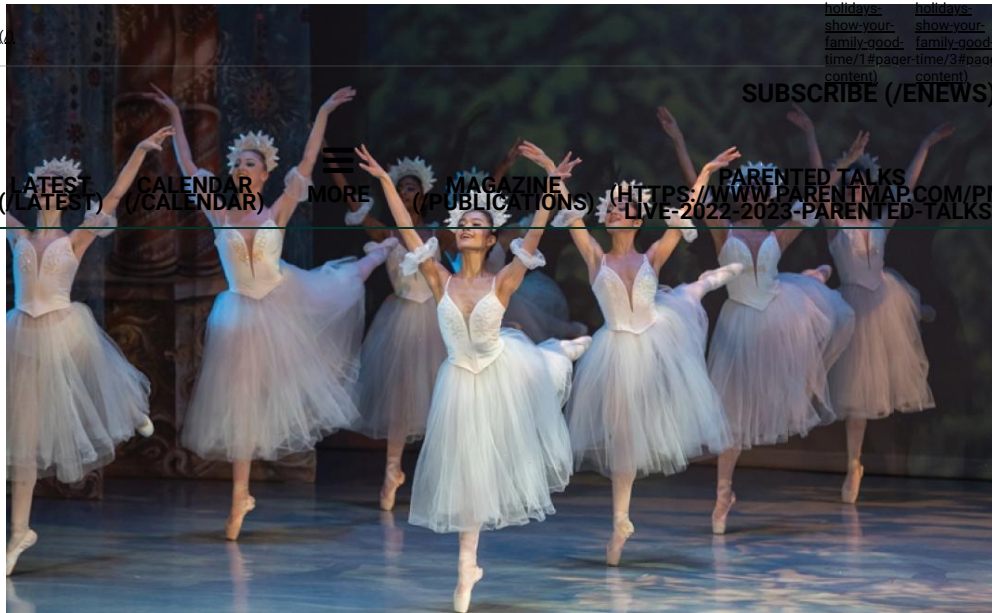
PHOTO: International Ballet Theatre's "The Nutcracker"