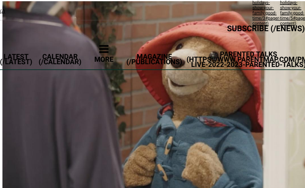
PHOTO: "Paddington Saves Christmas".