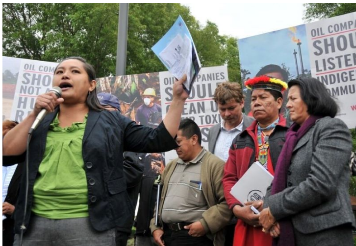
The Filipino American Coalition for Environmental Solidarity is building a movement for environmental justice.

FACES works for environmental justice for communities in the United States and in the Philippines. They build community and international solidarity through intergenerational cultural education and advocacy work. Programs include community gardens, youth internships, and educational events.