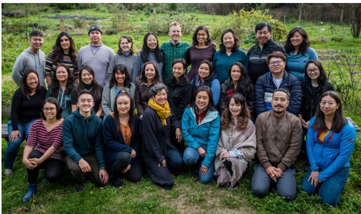
Asian Pacific Environmental Network is leading a transition away from an extractive economy based on profit and pollution toward local, healthy, and life-sustaining economies that benefit everyone.

just, sustainable one. Their programs confront major polluters, secure affordable housing, build climate resilience, and mobilize Asian voters.