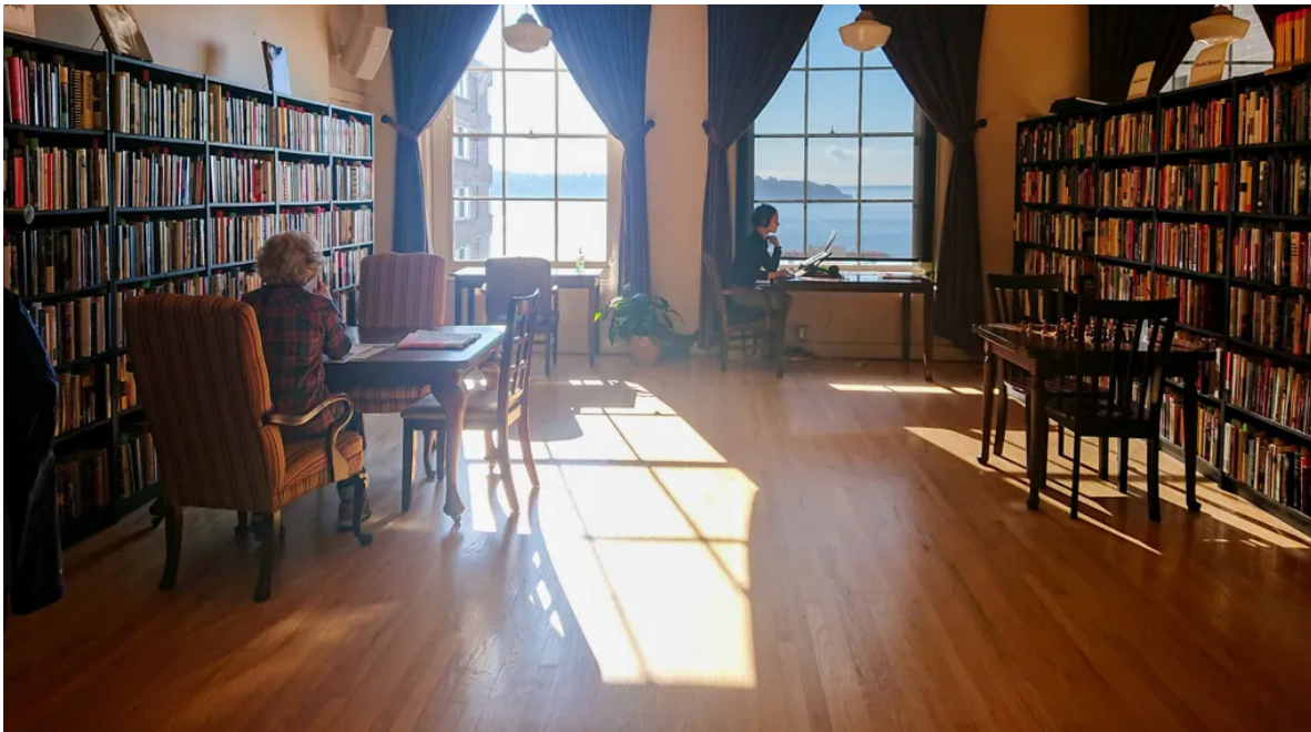
Folio's Elliott Bay Reading Room.