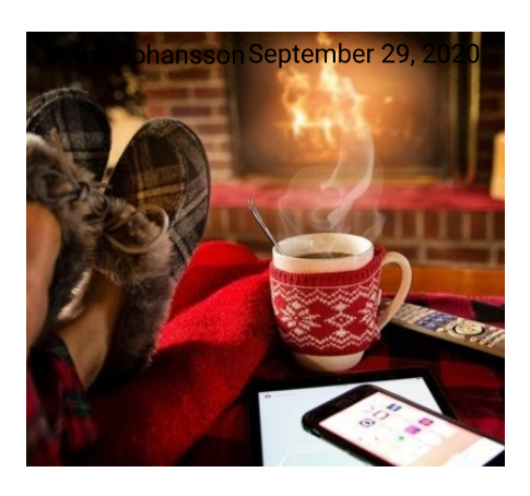
<u>5 Energy-Saving Tips for</u> <u>Colder Weather</u>

(https://earth911.com/inspire/weearthlings-get-the-plastic-out/)