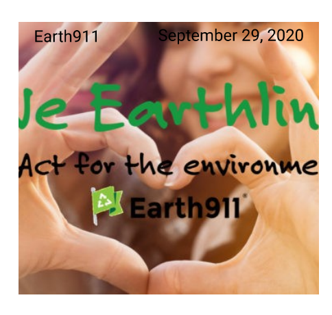
We Earthlings: Get the Plastic Out!

(https://earth911.com/inspire /your-food-waste-has-globalimpact/)