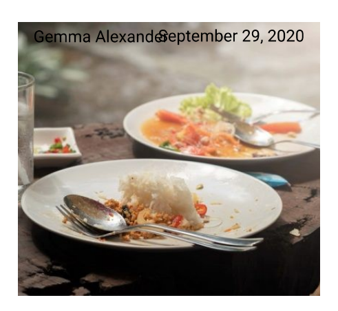
Your Food Waste Has Global Impact

(https://earth911.com/inspire /your-food-waste-has-globalimpact/)