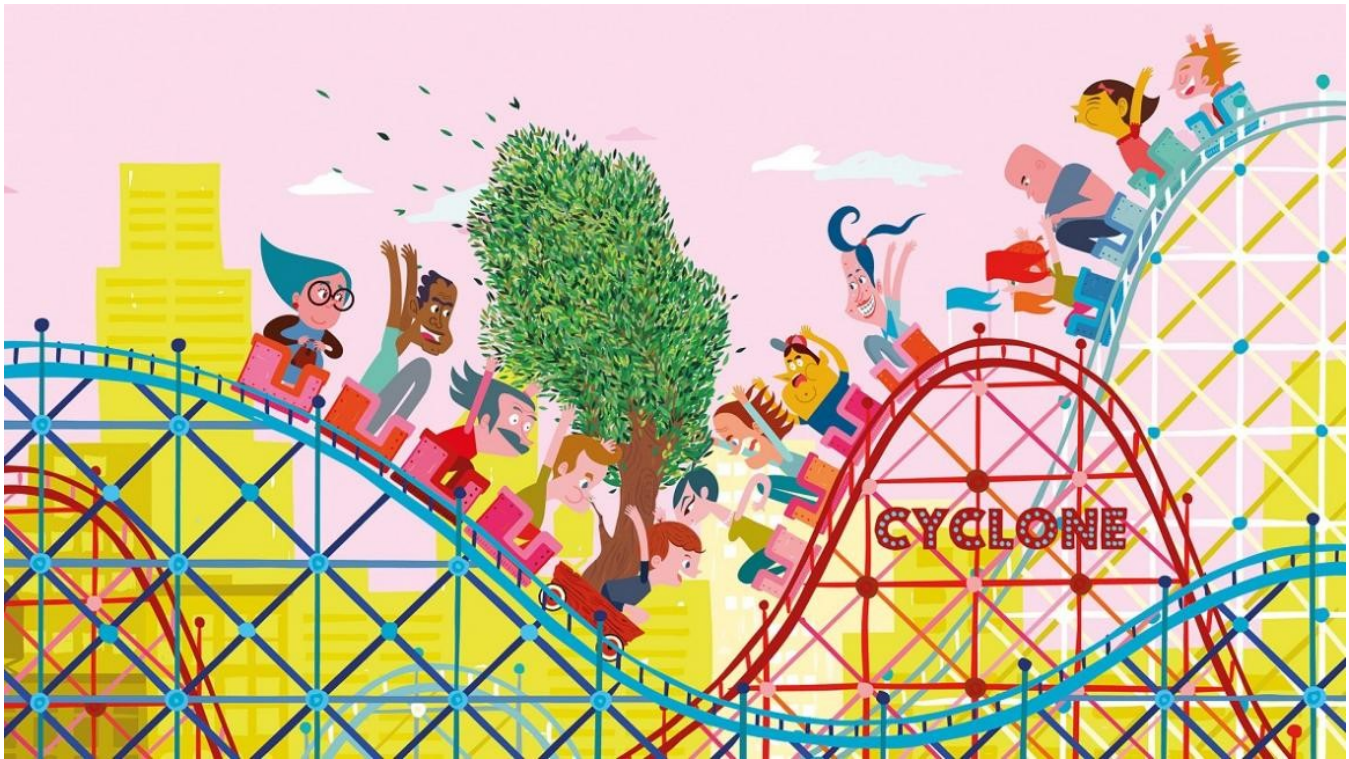
Still from short film "Miles Away" (Barbara Brunner, Switzerland, 2018, nonverbal) included in CFFS' shorts program called Kaleidoscope, recommended for ages 2 and older.