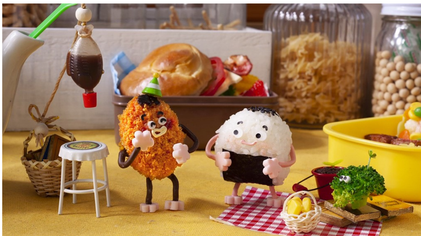
Still from short film "Konigiri-Kun Butterfly" (Mari Miyazawa, Japan, 2019, nonverbal) included in CFFS' shorts program called Sun Circle: Films from Japan, recommended for all ages.

Also of note is the annual Indigenous Showcase ( https://www.childrensfilmfestivalseattle.org/2020/indigenous-showcase-short-film-program-cffs/ ), featuring shorts by indigenous film makers of all ages. Inuit films are well represented this year, and there are two Lummi entries as well. The Lummi Nation is in northwest Washington.