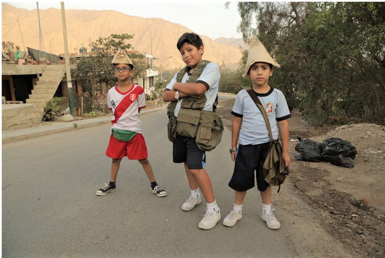
Still from short film "Like Playing" (Berenice Adrianzen Zegarra, Peru, 2018, in Spanish with English subtitles) included the CFFS' shorts program called Wild and Free, recommended for ages 8 and older.

Consistent with the festival's goal of encouraging children to see themselves as courageous change agents, this year's line-up features programs with age-appropriate presentations of timely themes like climate change, migration and gender identity.