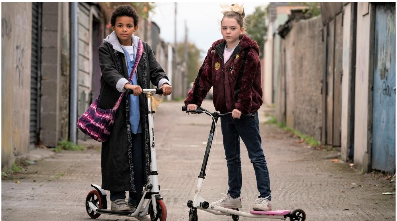
PHOTO: Still from short film "The Girl at the End of the Garden" (Bonnie Dempsey, Ireland, 2019), included the CFFS' shorts program called Lift-Off, recommended for ages 9 and older.

For 15 years, the Children's Film Festival Seattle