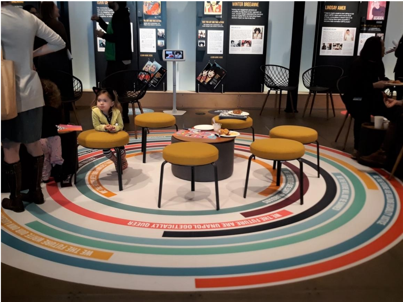
The center of the “We The Future” exhibit at the Gates Discovery Center.