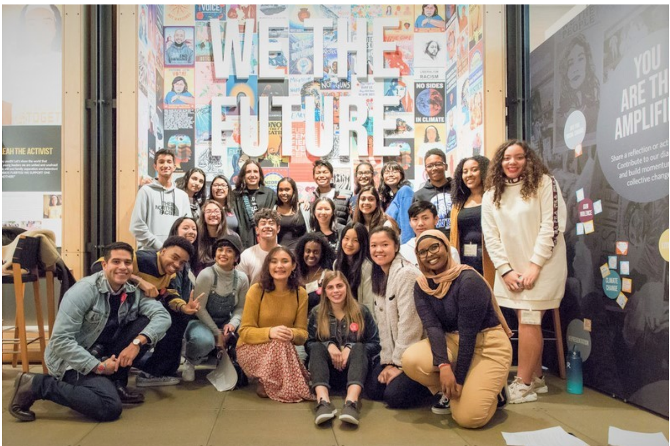
Gates Foundation youth ambassadors helped curate the "We The Future" exhibit.

The exhibit was inspired by an education campaign from Seattle-based nonpartisan design lab Amplifier ( https://amplifier.org/ ), the same group responsible for the " We the People " ( https://amplifier.org/campaigns/we-the-people/ )" campaign. Amplifier produced the iconic poster of a woman in an American flag hijab for that campaign.