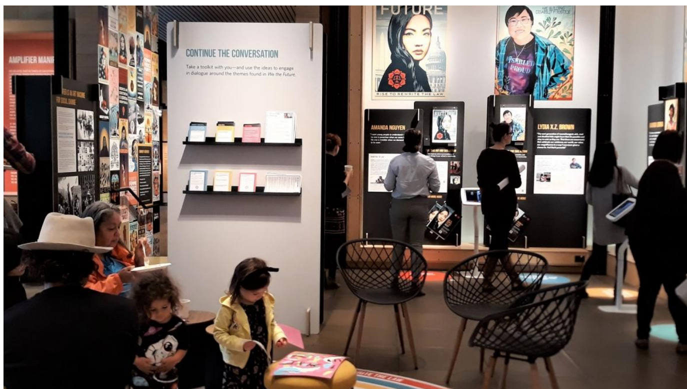
PHOTO: "We The Future" exhibit at the Gates Foundation Discovery Center.

Special exhibitions at the Bill & Melinda Gates Foundation Discovery Center ( https://www.discovergates.org/ ) always focus on the inspiring work of people who