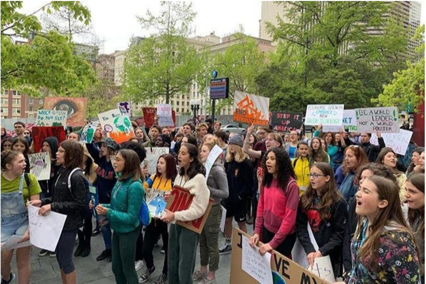
Youths participating in a Washington Youth Climate Strike event.