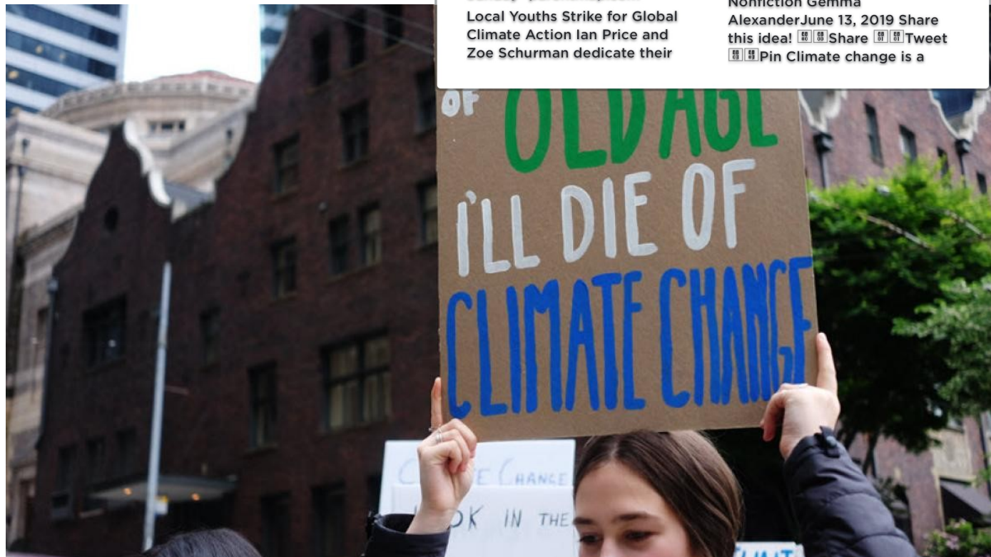
PHOTO: Youth participating in an Extinction Rebellion climate strike event

Youth around the world are organizing the September 2019 Global Climate Week of Action to coincide with the United Nations' climate conference. They want you to join them in a climate strike on September 20 and in making systemic changes to lessen our impact on the world's climate. If you or your child are looking for ways to be part of the solution, the Puget Sound region is home to several youth-led and family-friendly climate action organizations. Read on to learn