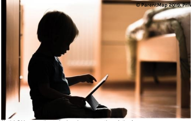
© ParentMap 2019. Privacy Policy (/node/169)

11 Ways to Raise a Voracious Reader (/article/encouraging-kids-read-books)