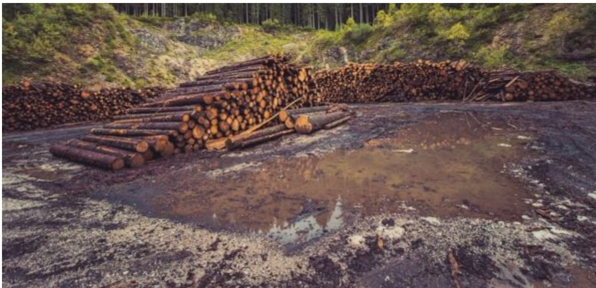
THE ENVIRONMENTAL DEFENSE FUND'S CLIMATE WORK INCLUDES SUPPORT FOR CLEAN ENERGY, REDUCING THE IMPACTS OF NATURAL GAS, AND PROMOTING SUSTAINABLE LAND USE OVER DEFORESTATION.