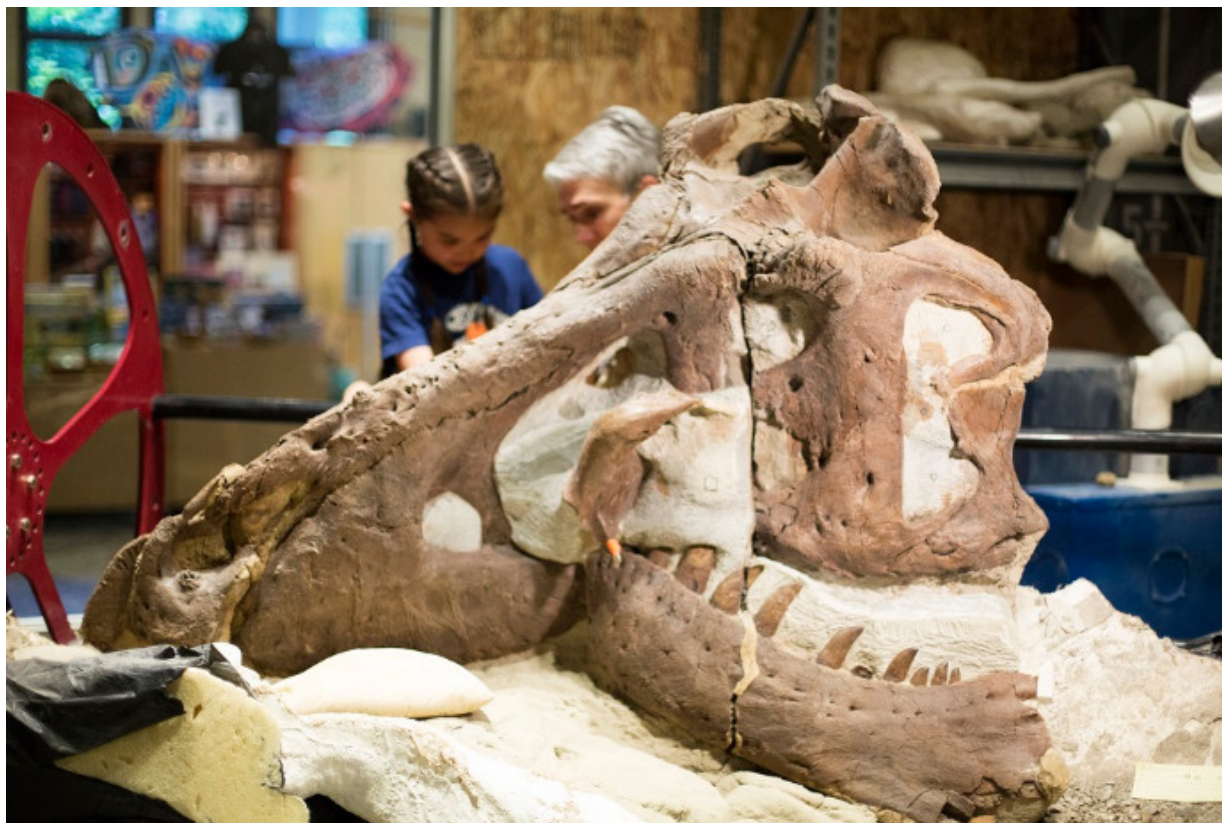
T. rex skull at the Burke.

Seattle-area families are in luck because there are terrific kid-friendly exhibits to visit this autumn. Even if museums aren't usually your thing, at least one of these exhibits is sure to capture your family's interest.