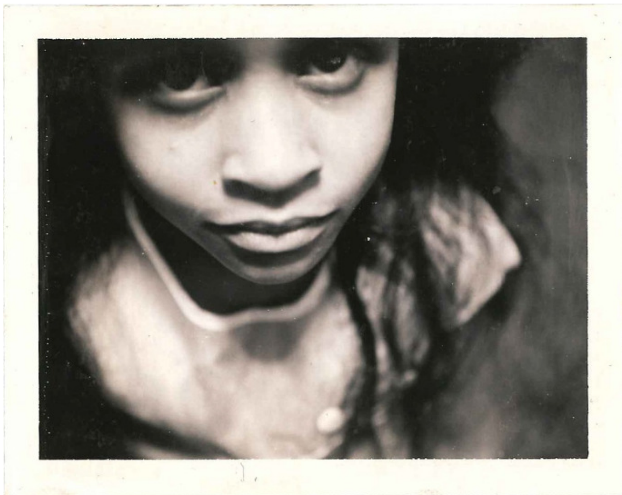
Polaroid from the collection of Robert E. Jackson. Courtesy of Bellevue Arts Museum