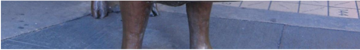
PHOTO: Rachel the Pig at Pike Place Market.