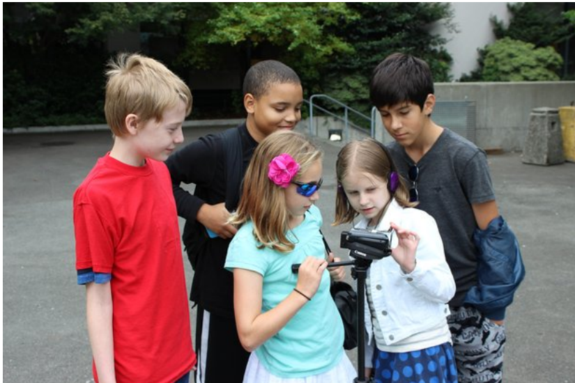
SIFF filmmaking classes

adventure titled Phantom Boy . Other highlights include Rainbow , an Indian film about two children on a quest to meet a legendary Shab Dukkhi. Screenings is $13; save money with six-pack and 20-pack ticket bundles. Looking for something family-friendly outside the F4F program? Try Kedi , a movie about the free-roaming cats of Istanbul.