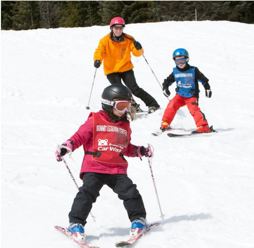
The Summit at Snoqualmie ski school