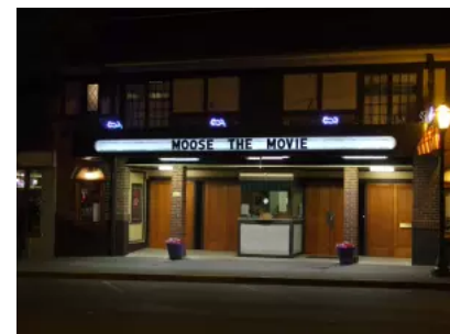
Blue Mouse Theatre, Tacoma

Movie schedule: June 12–18, Paddington ; June 19–25, Hunger Games: Mockingjay ; June 26–July 2, The SpongeBob Movie: Sponge out of Water