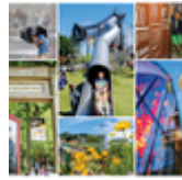
July 1, 2016