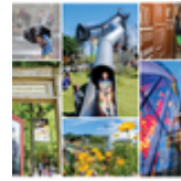
July 1, 2016